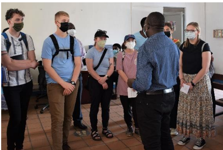
The Drake team with members of two VSLA groups at Acholi Quarters in Nakawa division.