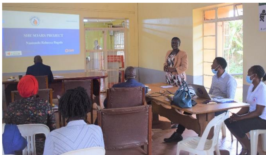
ROM team during a SHE SOARS inception meeting at Nakawa Division Headquarters.

ROM has launched yet another intervention to support adolescents' life skilling. The Sexual, Reproductive Health and Economic Empowerment Supporting Out of School Adolescent girls' Rights and Skills (SHE-SOARS) project aims at increasing equitable use of ASRHR services by diverse groups of adolescent girls particularly those out of school and children's rights holders. ROM will be implementing the SHE SOARS project in Nakawa and Makindye divisions, Kampala District.