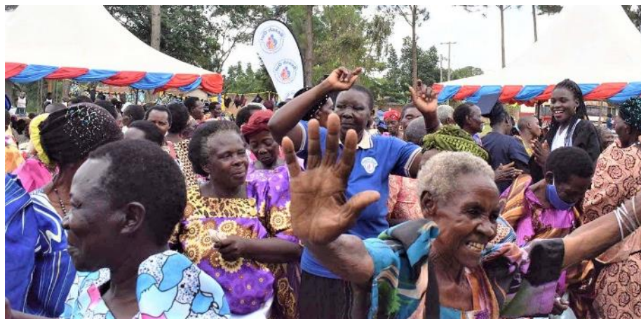
A section of grandmothers dancing at the ceremony

An annual Grandmothers' Day is one of the much sought-after joy filled events for Grand Mothers in the ROM Project that restores hope, brings back many happy memories, offers company at the lone stage of life building tenacity among the extremely vulnerable elderly.