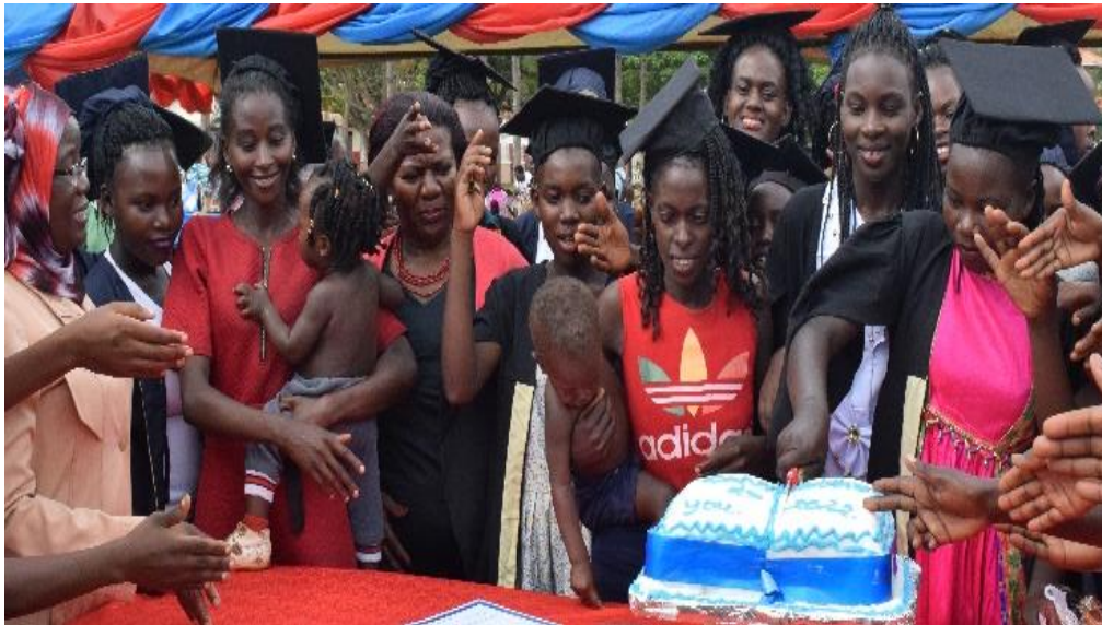
Some of the Adolescents and Young Mothers Celebrating the Second Chance Schooling at ROM

55 adolescents and young mothers under the care of the ROM supported grandmothers received certificates of completion in hair dressing and tailoring infused with life skilling and practical entrepreneurship from ROM.