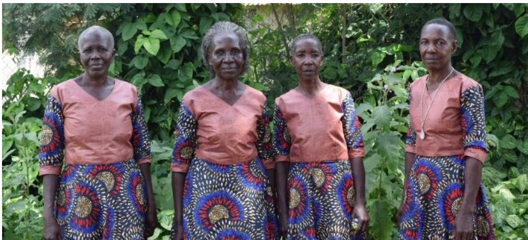
A Grandmothers Group clad in their African Kitenge Designed by their Trained granddaughters

Cutting extreme vulnerabilities starts with one owning of their success. At ROM we offer second chance schooling that works as a springboard for multiple transition pathways beneficiaries aspire for and with the confidence developed, they are propelled to better livelihoods.