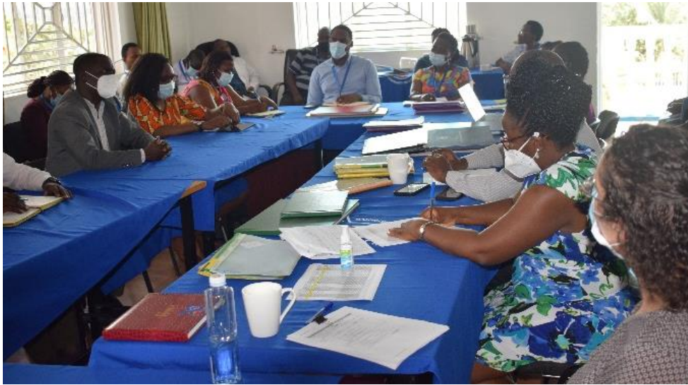
CDC and ROM teams during a debrief at ROM