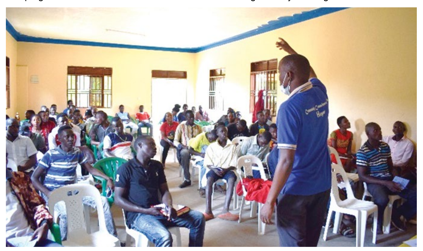
A ROM staff taking participants through a session during the training at Mityana.

The program focuses on work readiness and soft/life skilling for the youths aged 15-29.