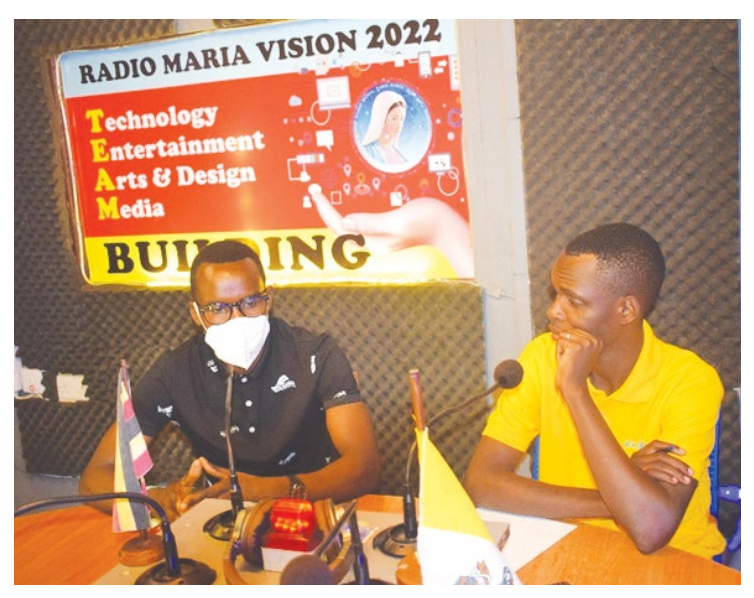
A Reach Out Mbuya Staff with the moderator during the talk show

th March 2022 was international Women's day and Reach Out Mbuya joined the rest of the world to commemorate the special day, with a live talk show on Radio Maria. Cervical cancer and Maternal and Child health Care and Prevention of Mother to Child Transmission of HIV services were discussed. Grounded on the 2022 theme, #BreaktheBias, the key message was women standing strong to confront stereotypes and discrimination related to cervical cancer and HIV. They were encouraged to go for screening, and also seek other available services such as the self-testing kits, antenatal services, postnatal support and immunization.