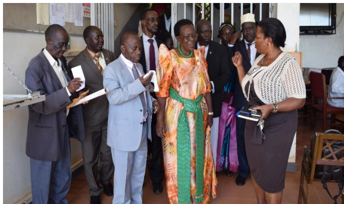
The Buganda cultural leadership during a tour by the ROM Executive Director